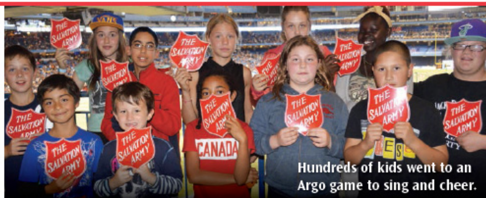
Hundreds of kids went to an Argos game to sing and cheer.