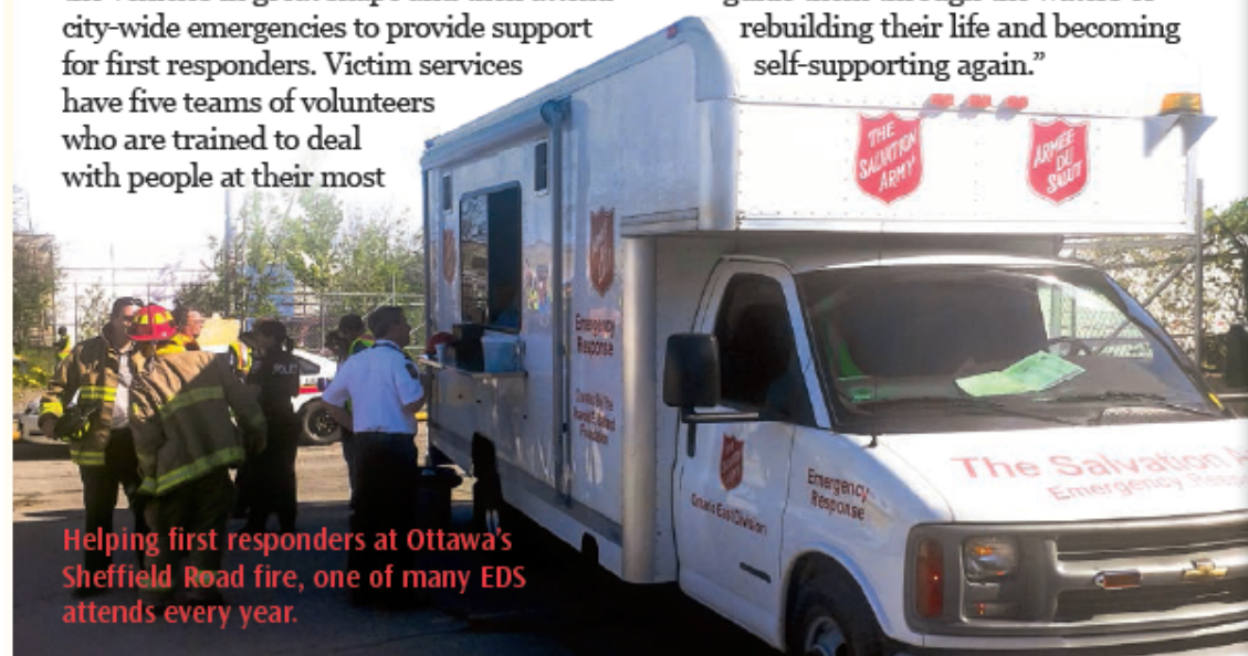
Helping first responders at Ottawa's Sheffield Road fire, one of many EDS attends every year.