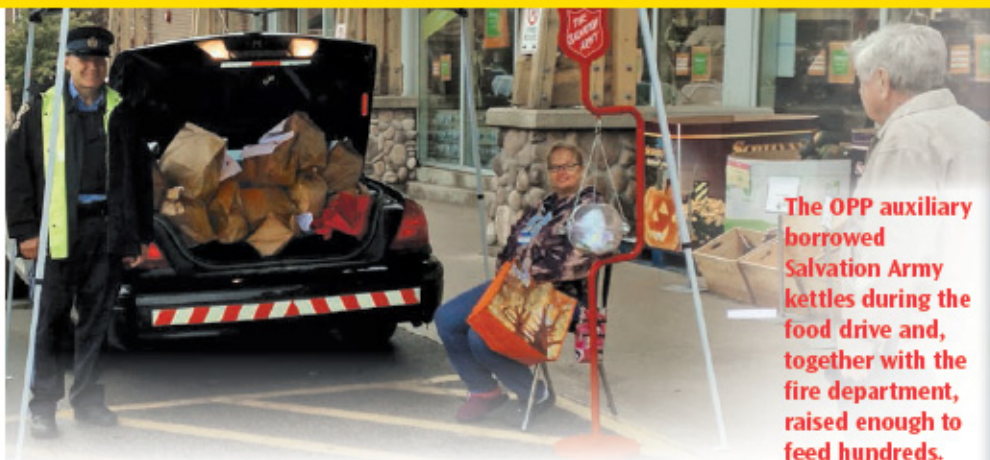
The OPP auxiliary borrowed Salvation Army kettles during the food drive and, together with the fire department, raised enough to feed hundreds.